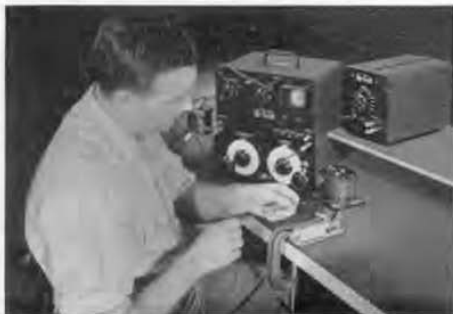
Figure 5. The Comparison Bridge used in adjusting an air-core inductor to 0.1% tolerance at General Radio's West Concord (Mass.) plant.

Grounding: Two ground positions are provided, one of which grounds the junction of the standard and unknown impedances. With this connection, the total impedances between the high terminals and ground are compared. In the other connection, the junction of the ratio arms