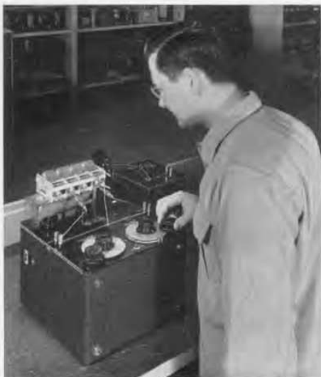
Figure 6. Another application in our own plant: testing and adjusting four-gang capacitors for proper tracking. The bridge is also used in the adjustment of ganged potentiometers.

values of impedance the voltage is decreased, corresponding to a source impedance of the order of 100 \Omega .