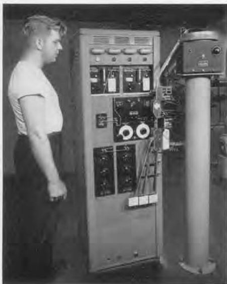
Figure 3. PROJECT TINKERTOY is the code name assigned to a program conceived and developed by the National Bureau of Standards for the Navy Bureau of Aeronautics, which involved the Modular Design of Electronics (MDE) and the Mechanized Production of Electronics (MPE).

More than 20 machines are utilized to produce electronic subassemblies automatically. Uniformity and reliability of product is achieved by employing automatic 100 percent inspection at nearly every station in the production process. This photograph shows equipment used in automatic inspection of titanate capacitors for specific capacity value. Type 722 Precision Capacitors with a range of from 110 to 1100 micromicrofarads and a Type 1604 Comparison Bridge are incorporated in the inspector. One of the precision capacitors is set at the upper tolerance limit of the required capacity, and the other is set at the lower tolerance. As the titanate bodies exit from the vibrator feeder, all silvered surfaces are checked for continuity. The capacitor is then automatically released and falls into the inspection circuit containing the precision capacitors and comparison bridge. The output of the bridge controls three inspection circuits: one to reject those capacitors that are above the upper tolerance, another to reject those bodies below the lower tolerance, and the final circuit to accept the capacitors that fall within the required tolerances. The automatic inspection of a single capacitor can be accomplished in less than half a second.